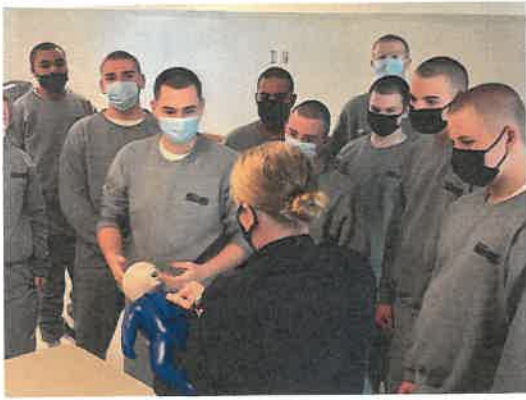
All Cadets were able to go through CPR Certification