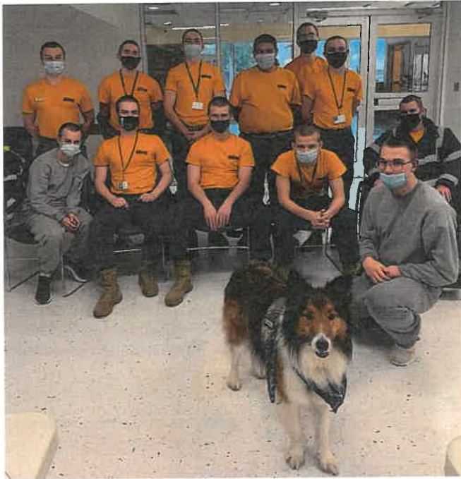
★★★★★★ The Cadets at Mountaineer Challenge Academy South were introduced to "Beau" who is training to be a therapy dog. Animal Veterinary Club