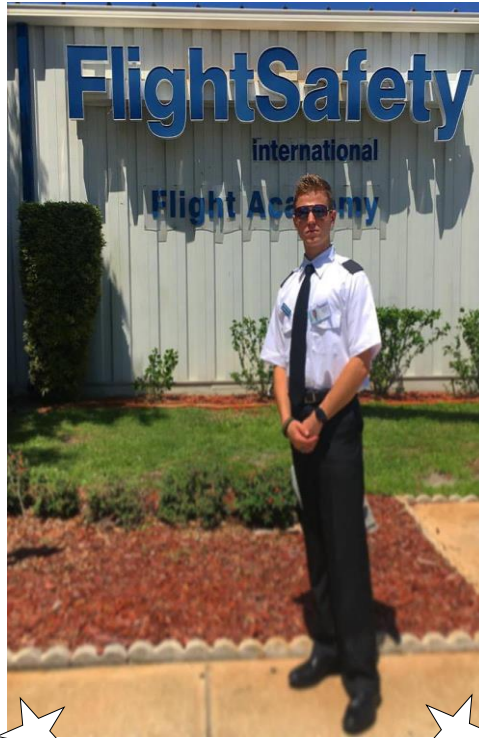
★ Class 2-2016 ★